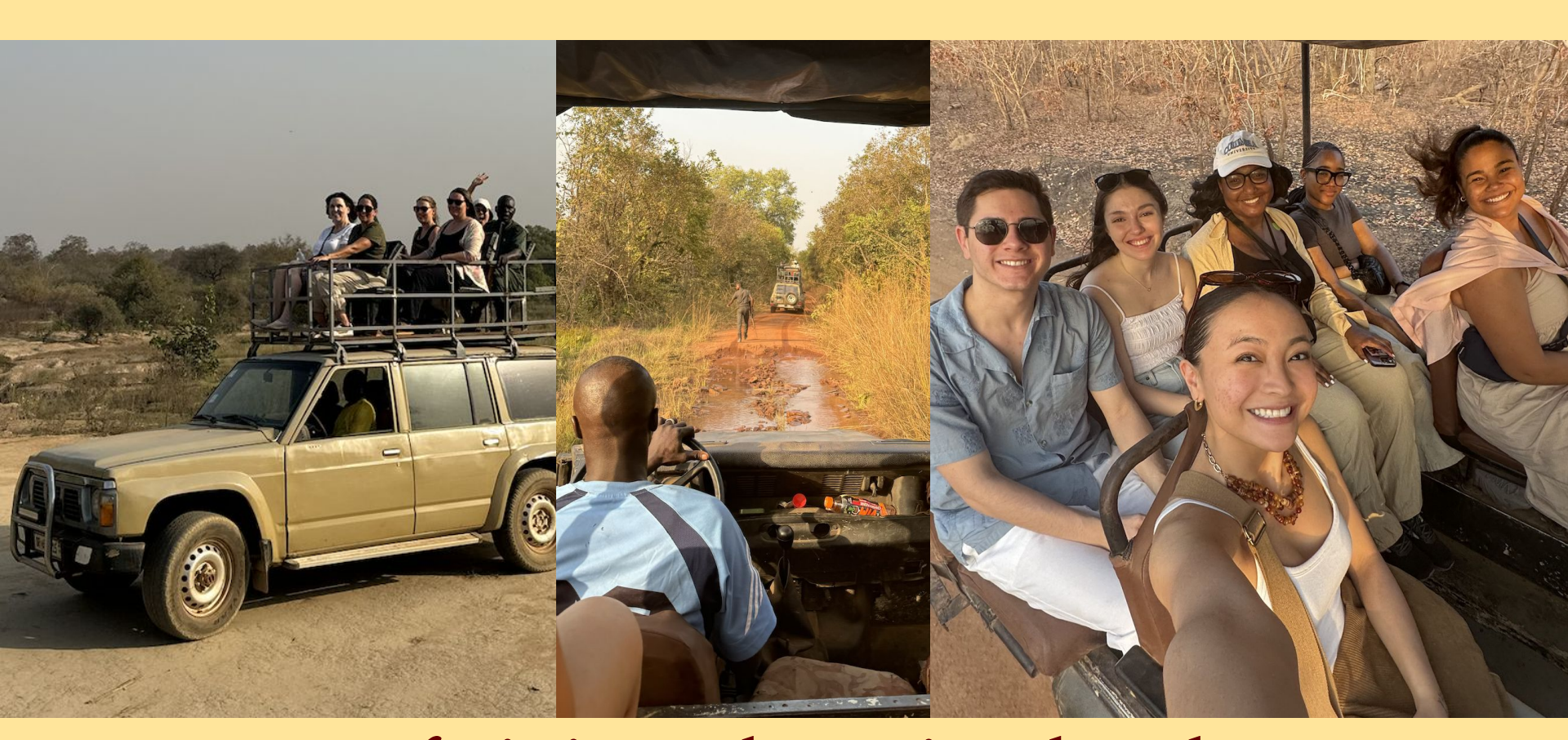
Safaris in Mole National Park