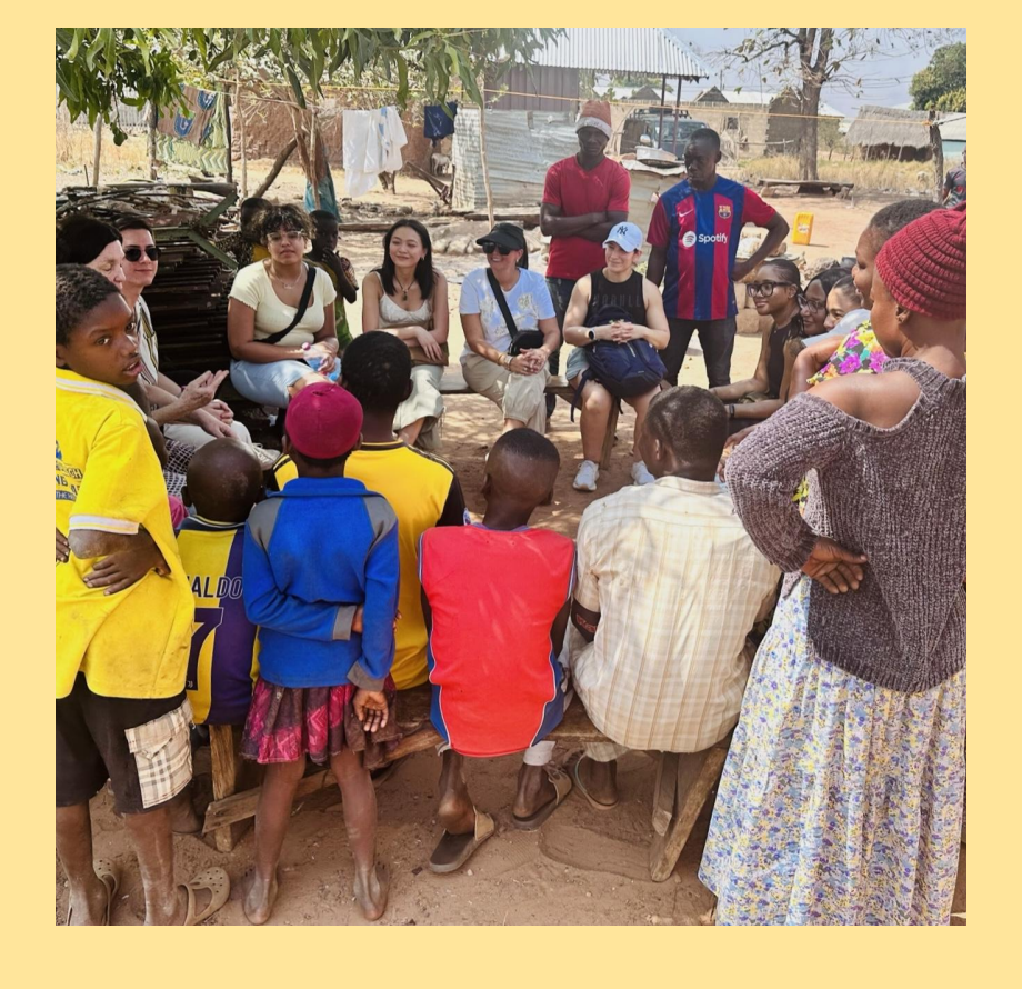
Getting to know the Larabanga Deaf & Hard of Hearing Community and Teachers