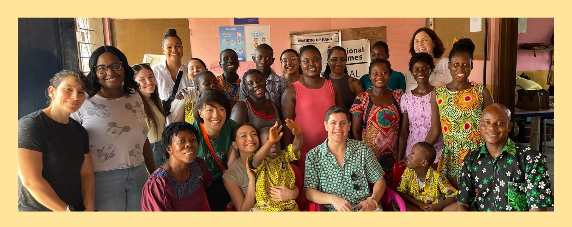
TC Team with the Aboom School Team!