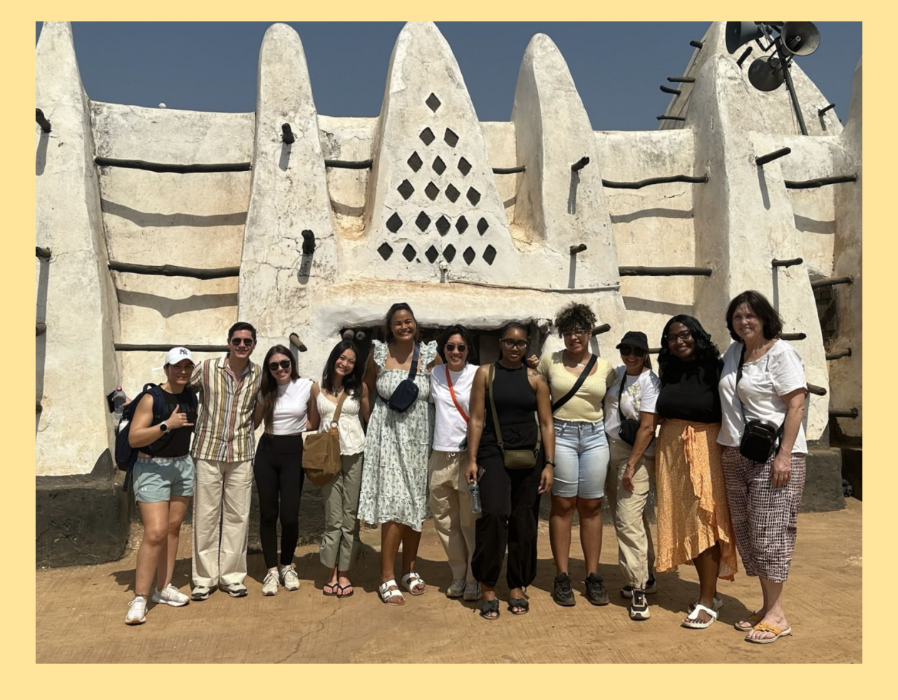
Larabanga Mosque built in (1421) ➤ Mystic